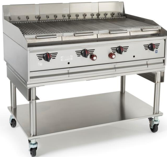
Unit shown FC48 with optional equipment stand and casters