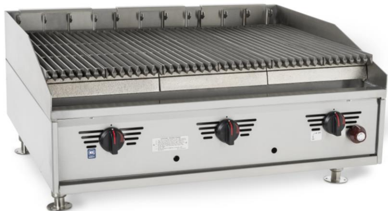
Unit shown FCL36 with optional cast iron grids